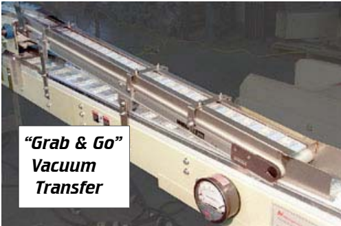
"Grab & Go" Vacuum Transfer