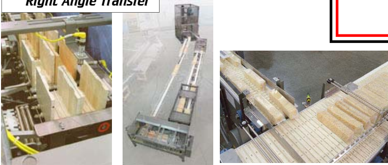
Right Angle Transfer